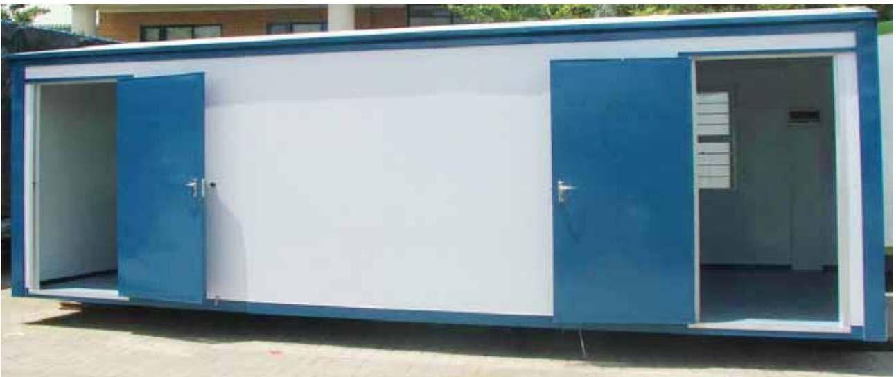
As a caring organization, TCTA donated this park house to the community of Charl Cilliers in commemoration of 2008 World Aids Day. This house is stationed at the police station and will be used as a trauma centre for counseling.

TCTA will consider using the same model for the implementation of other projects as part of its Socio-Economic Development Strategy and the focus will mainly be on rural women.