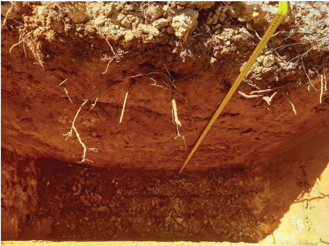
Figure 58: TPR07 Profile