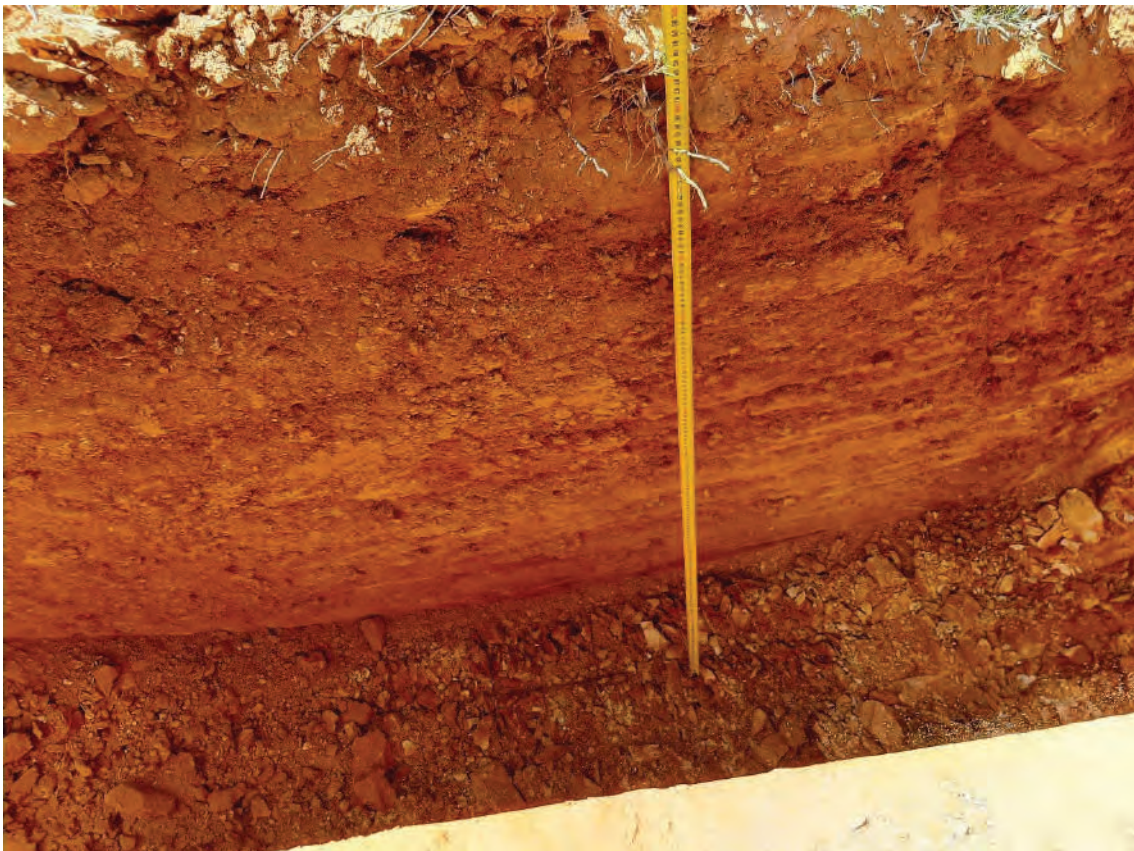
Figure 54: TPR03 Profile