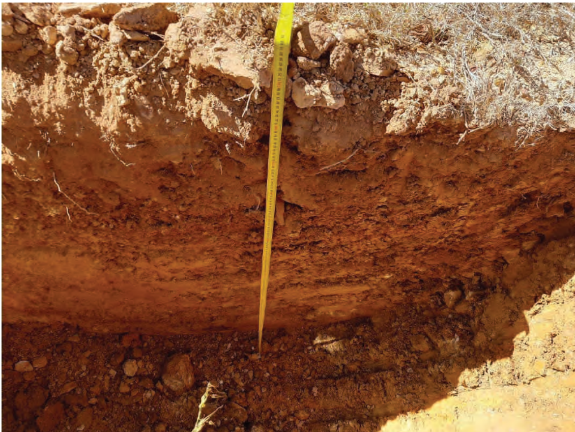
Figure 60: TPR09 Profile