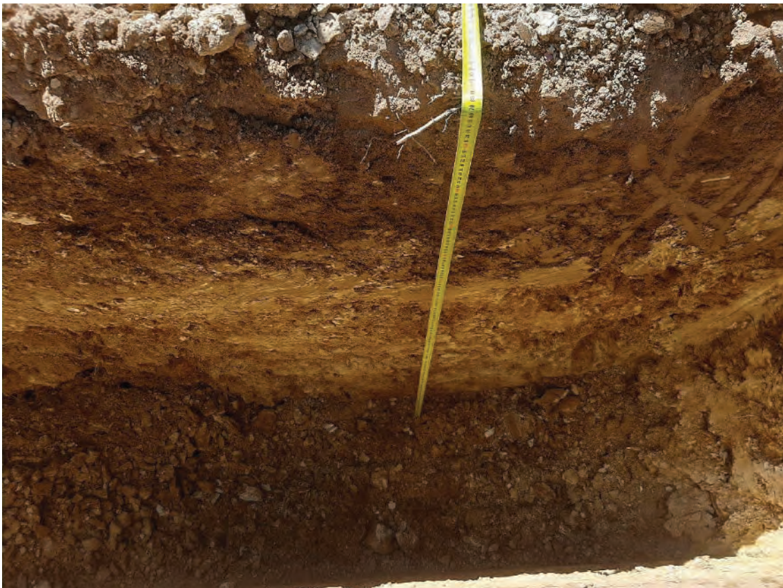
Figure 53: TPR02 Profile