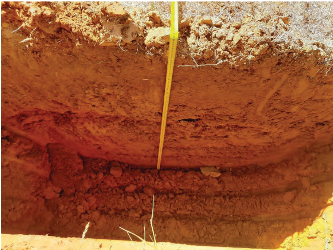
Figure 57: TPR06 Profile