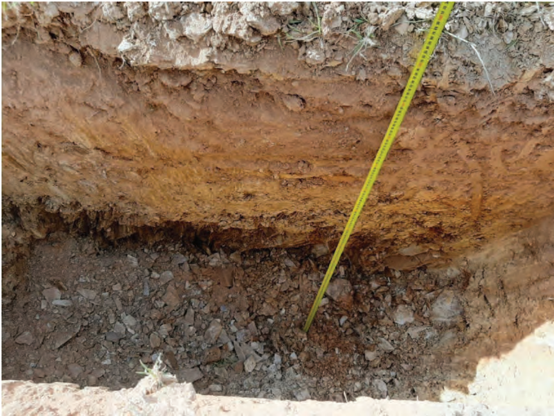
Figure 63: TPR12 Profile