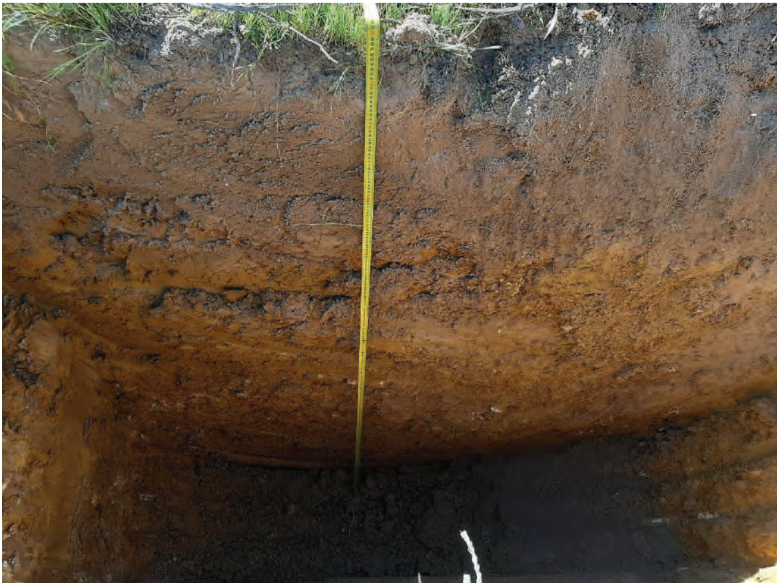
Figure 48: TPP30 Profile