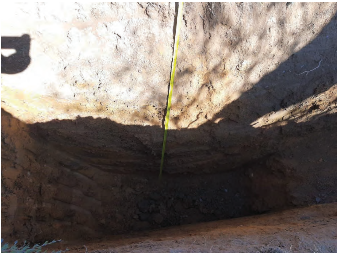
Figure 47: TPP29 Profile