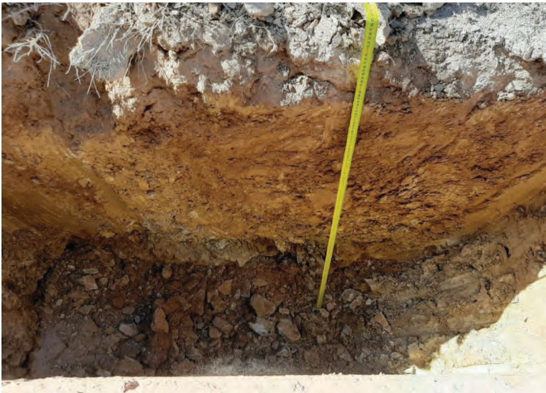
Figure 61: TPR10 Profile