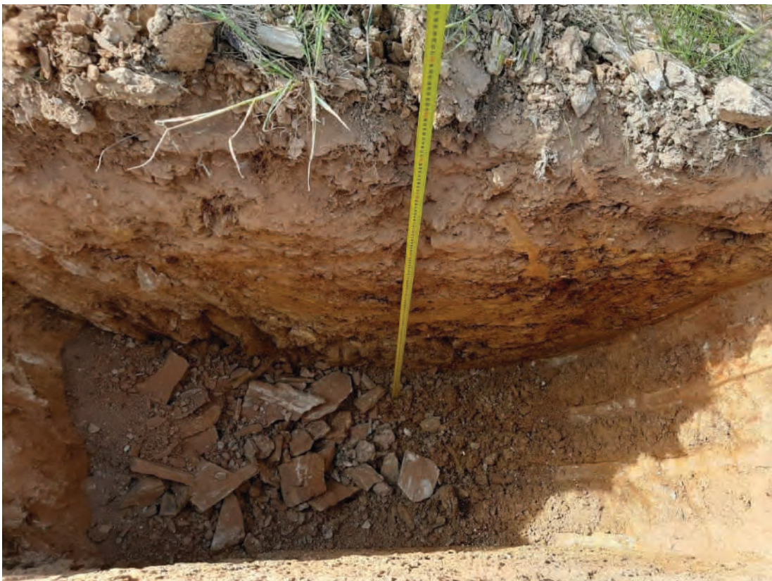
Figure 62: TPR11 Profile