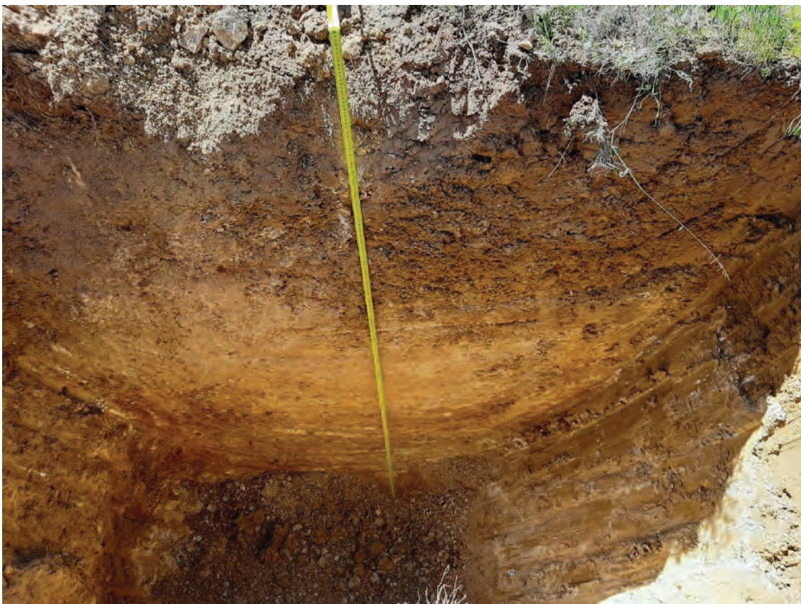
Figure 49: TPP31 Profile