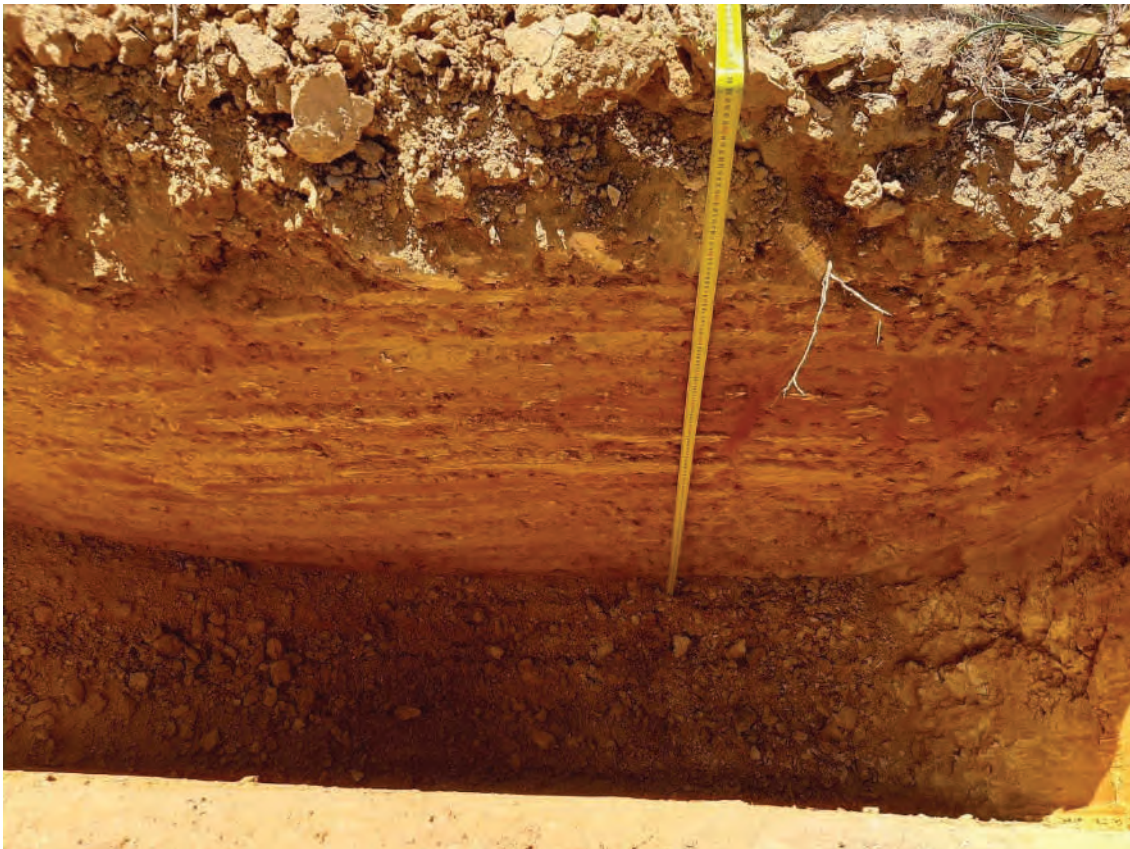
Figure 52: TPR01 Profile