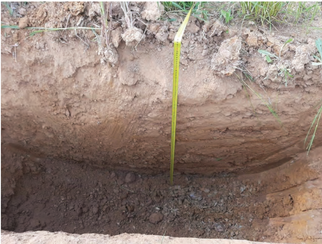
Figure 64: TPR13 Profile