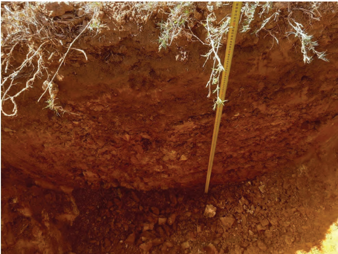
Figure 59: TPR08 Profile