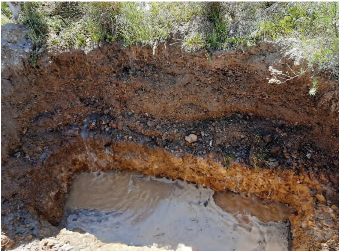
Figure 51: TPP33 Profile