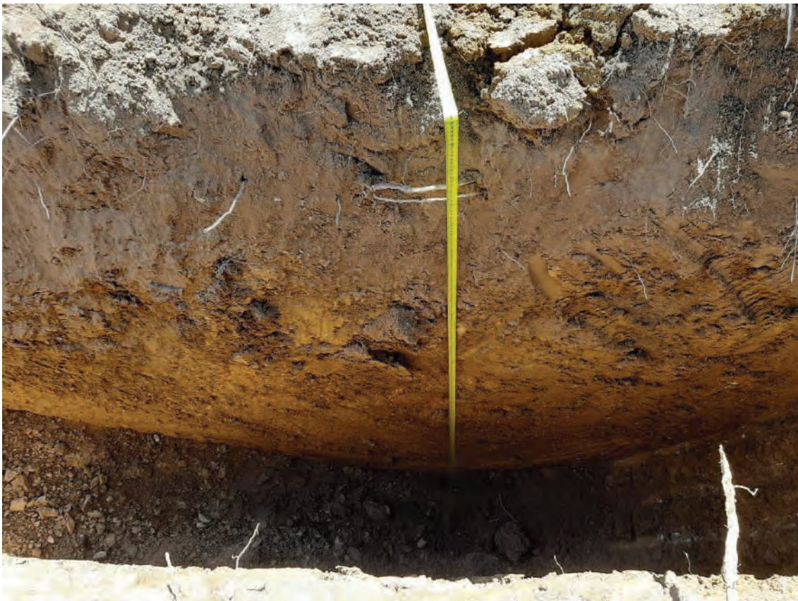
Figure 50: TPP32 Profile